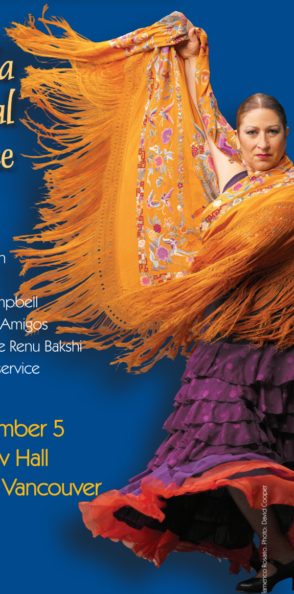
Flamenco Dancers